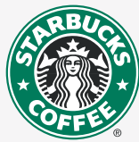
VIPIN GUPTA CTO at Starbucks India